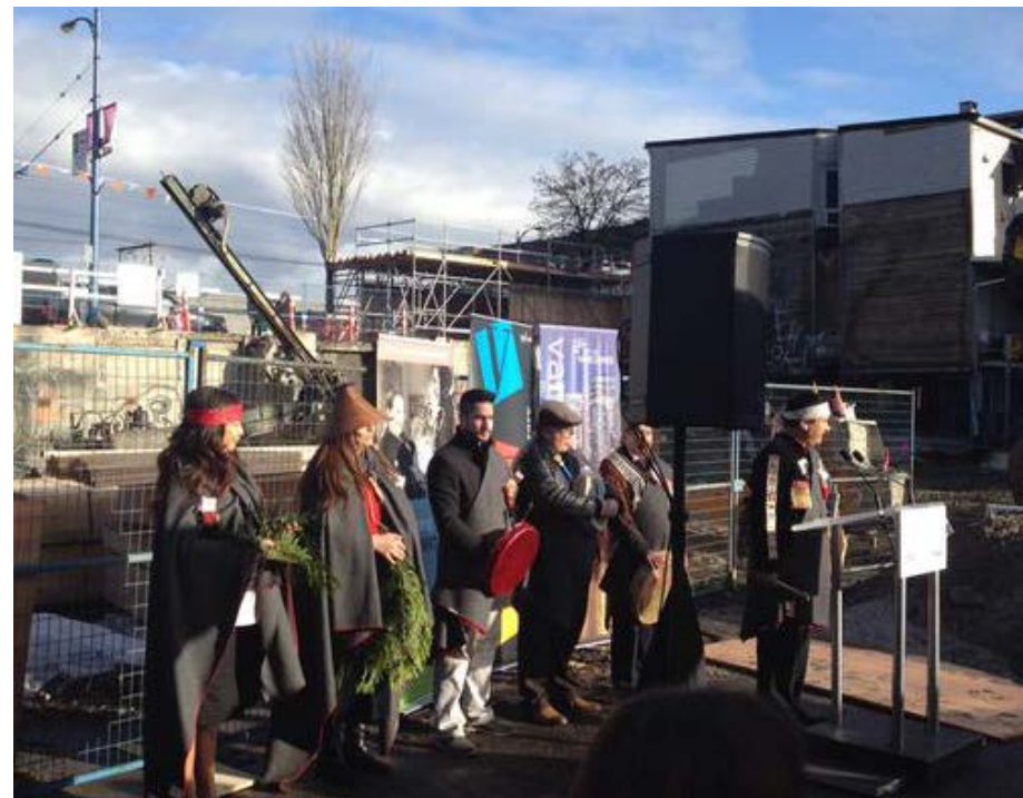
VPL's néčá?mat ct Strathcona branch groundbreaking and ceremony