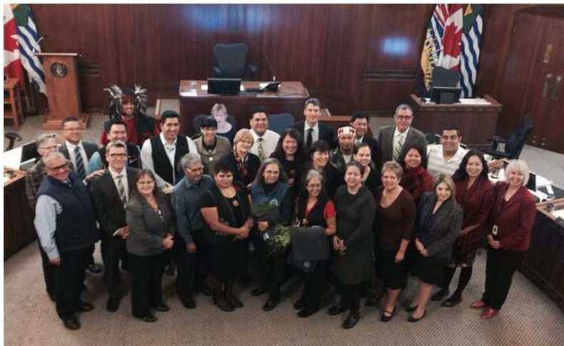
City Council brushing off ceremony, December 2014