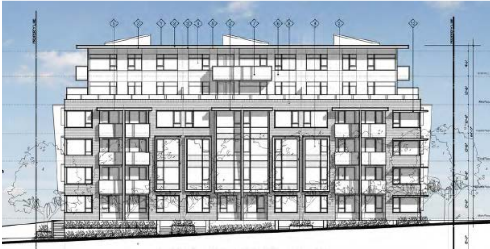
Cambie Street Elevation (west)