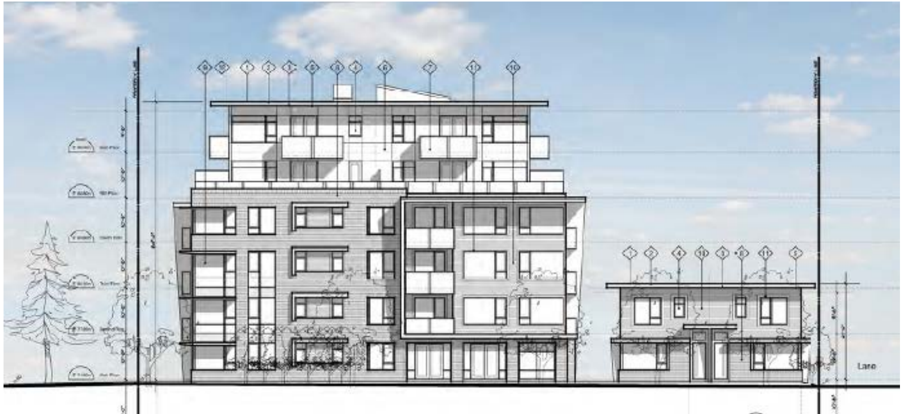
26 th Avenue Elevation (south)