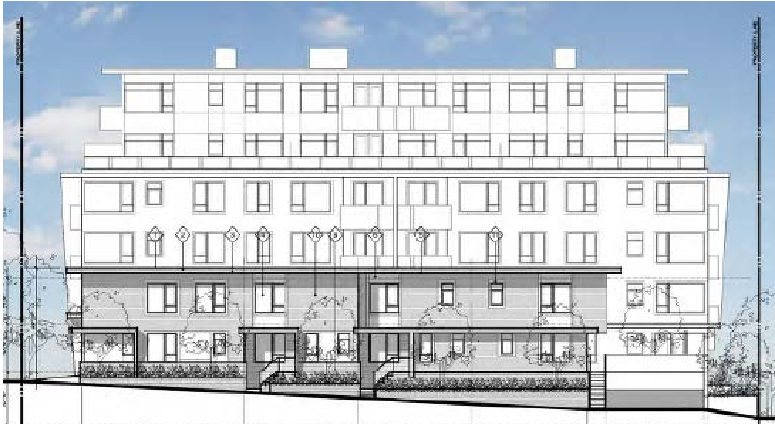
Lane Elevation (east)