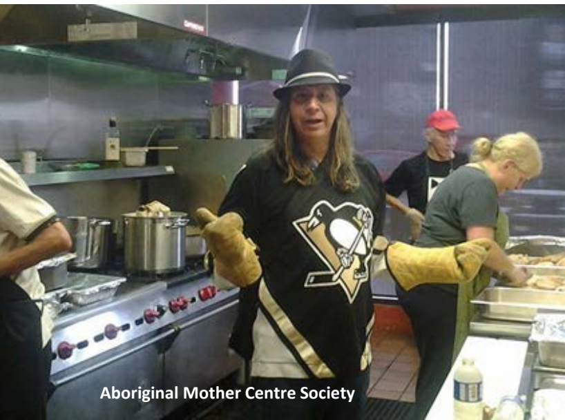
Aboriginal Mother Centre Society