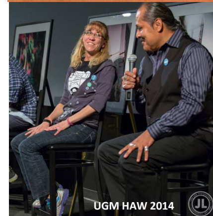
UGM HAW 2014