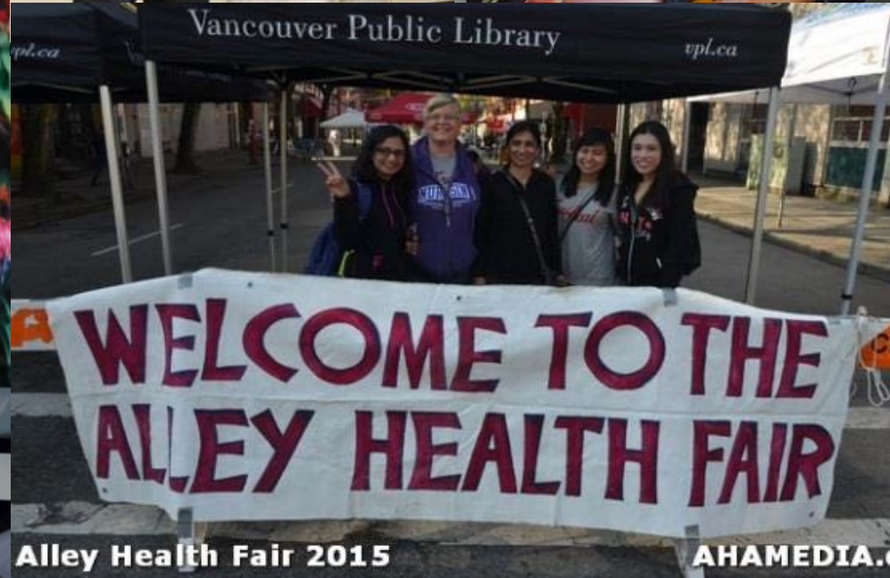
Alley Health Fair 2015