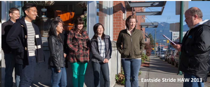
Eastside Stride HAW 2013