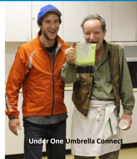
Under One Umbrella Connect