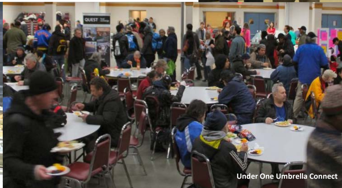
Under One Umbrella Connect