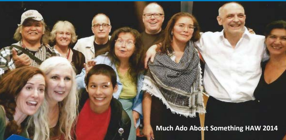
Much Ado About Something HAW 2014