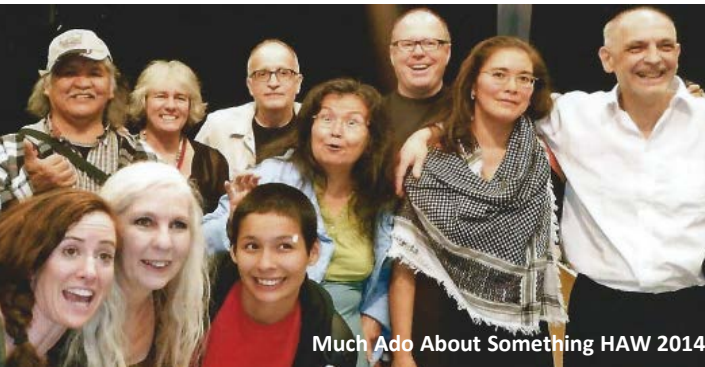
Much Ado About Something HAW 2014