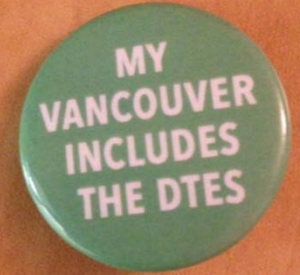
UGM HAW 2013