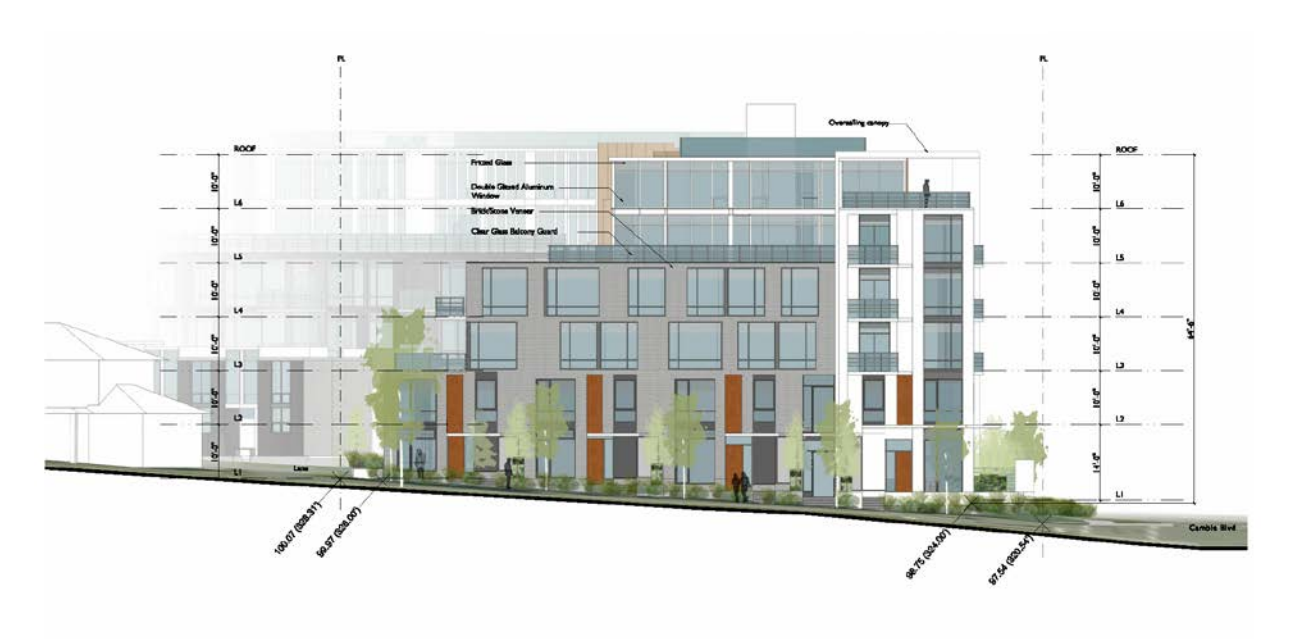
Building B North Elevation (from 33rd Avenue)