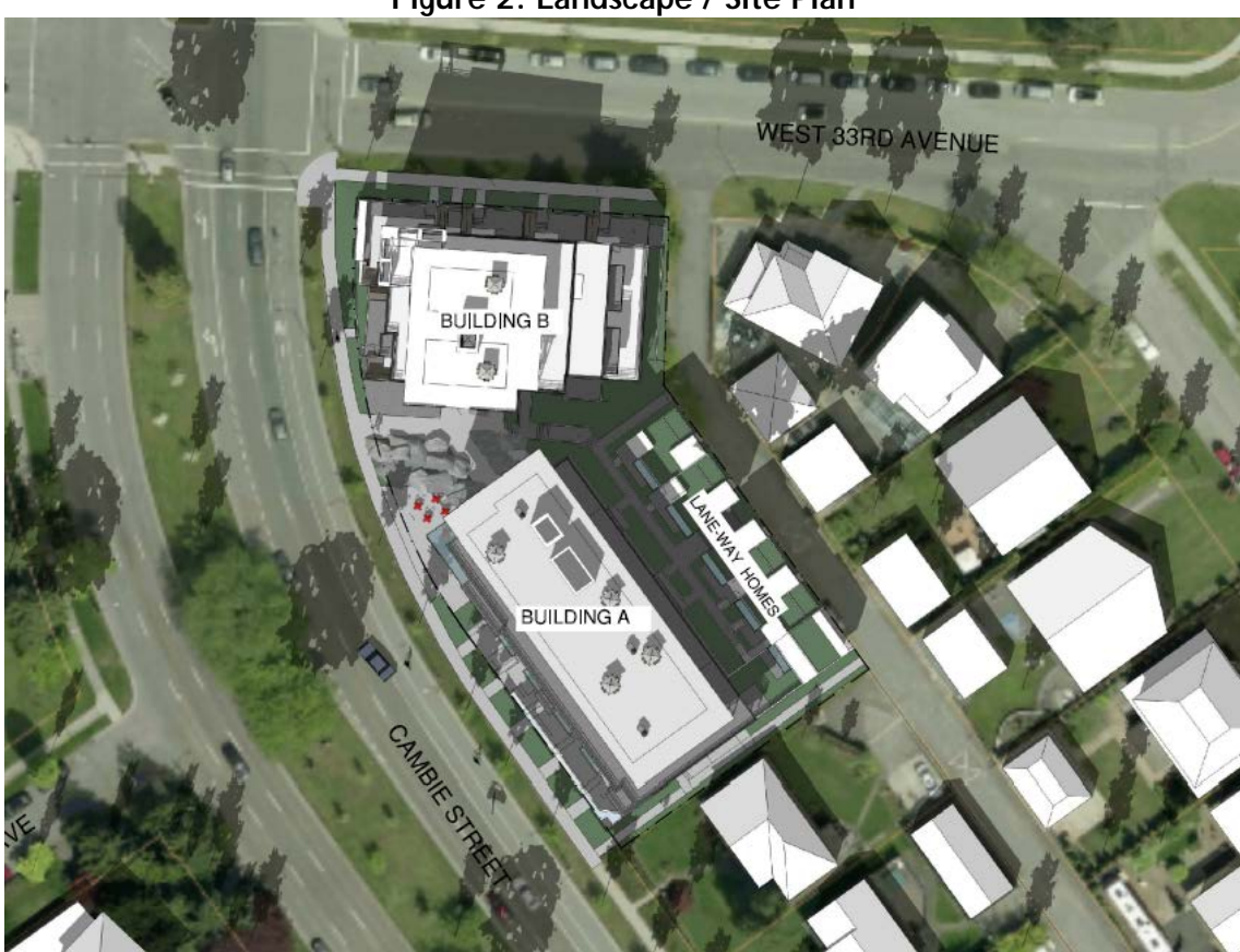
Figure 2: Landscape / Site Plan

The applicant proposes to rezone four lots located at 468 West 33rd Avenue, 4956 and 4958 Cambie Street from RS-1 (One-Family Dwelling) District to CD-1 (Comprehensive Development) District. One six-storey mixed-use building, Building A, one six-storey residential building, Building B, and two-storey townhouses at the lane are proposed (see Figure 2). In total, the application proposes 65 dwelling units with a total FSR of 2.57 and a building height of 22.7 m (74 ft.), over two levels of underground parking accessed from the rear lane.