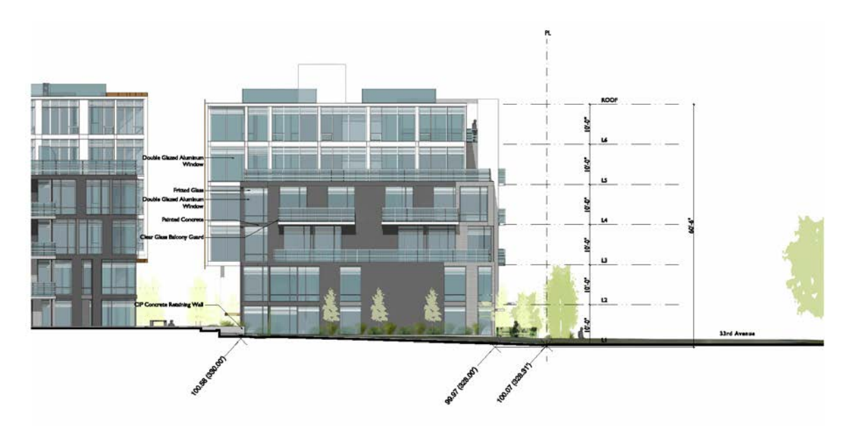
Building B East Elevation (Lane)