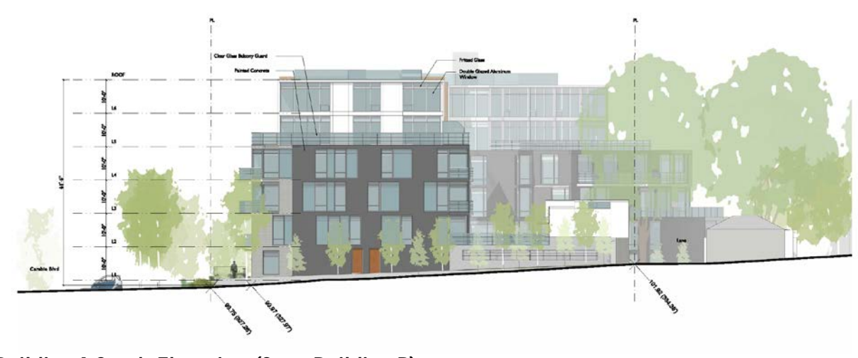
Building A South Elevation (from Building B)