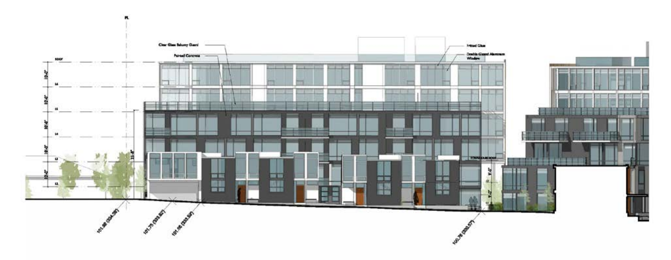
Building A East Elevation (Lane)