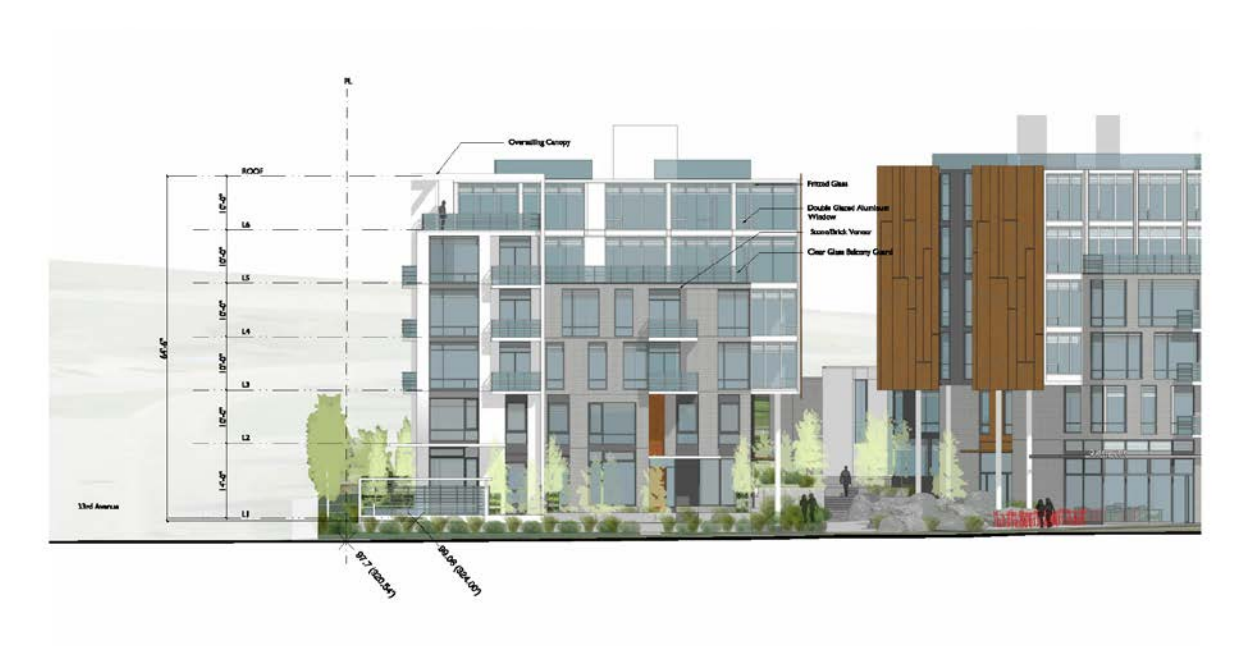
Building B West Elevation (Cambie Street)