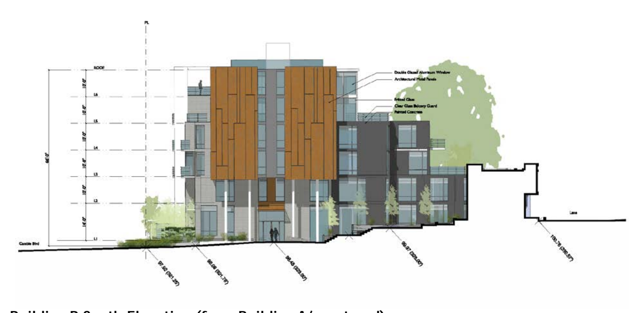
Building B South Elevation (from Building A/courtyard)