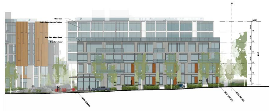
Building A West Elevation (Cambie Street)