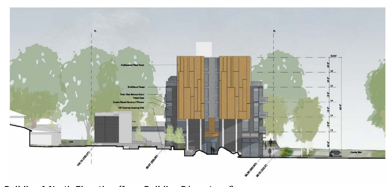
Building A North Elevation (from Building B/courtyard)