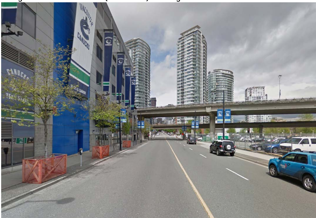
Figure 1: Abbott Street (700-block) looking north towards Pacific Boulevard

Several discussions with the Quinn family helped to identify and narrow down the options, with the goal of finding an option that would be meaningful for Pat Quinn's family members as well as the broader Vancouver hockey community. Feedback from the Quinn family indicated that the Abbott Street option would be their preferred choice, given the central location and its proximity to the Vancouver Canucks venue (see Figure 1, below, and Appendix A).