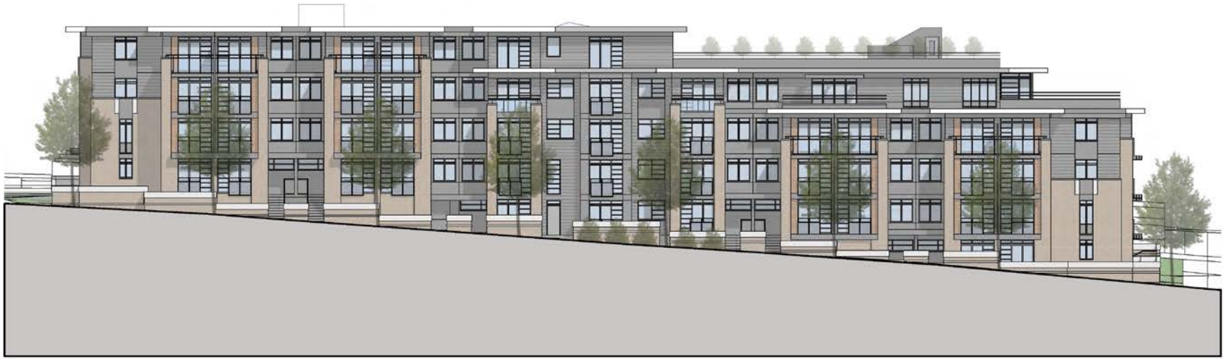
West Elevation (Fraser St)