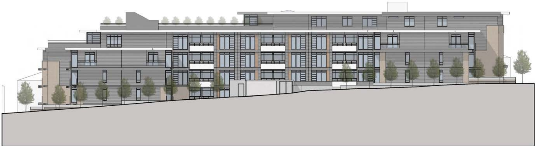
East Elevation (Lane)