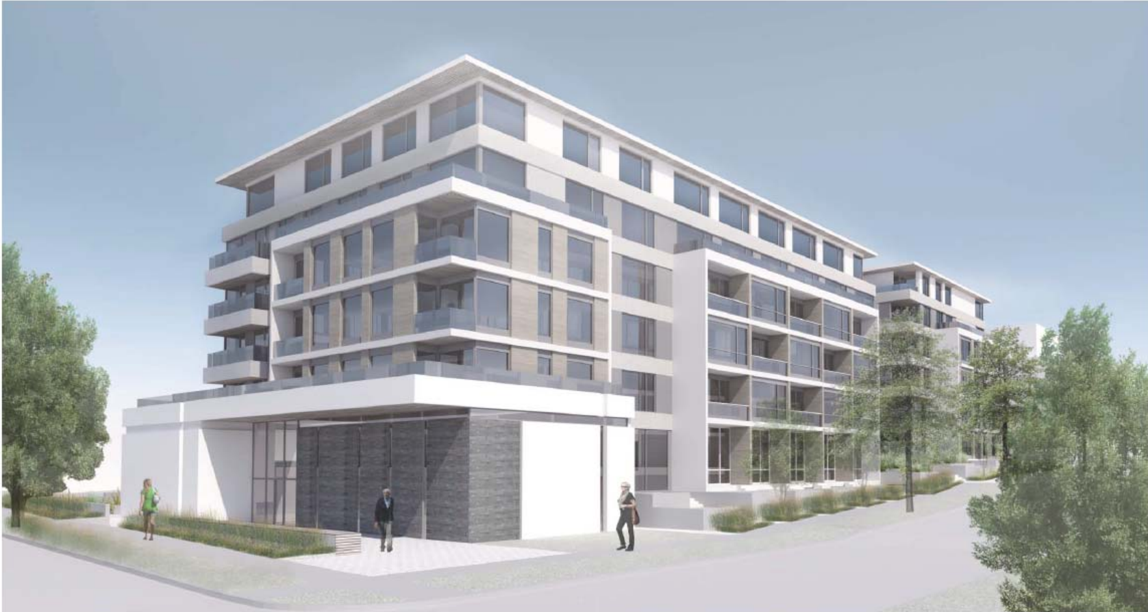
Corner of 61st and Cambie