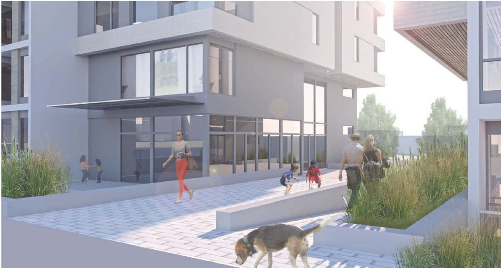
Amenity and Courtyard