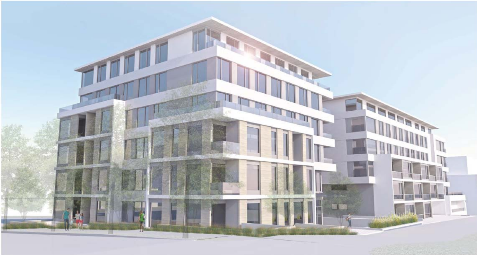
Corner 60th and Lane