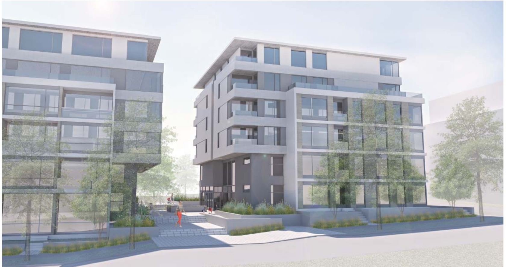
Courtyard view from Cambie