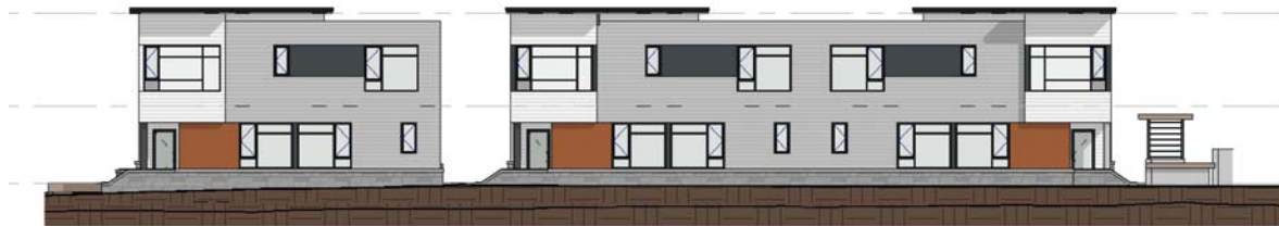
South Elevation (Townhouses)