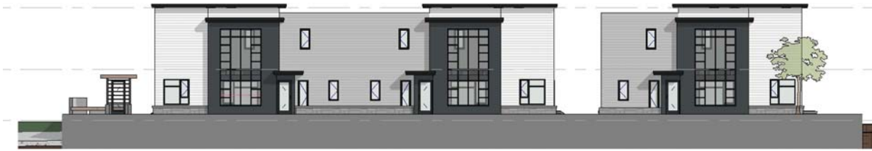
North Elevation (Townhouses)