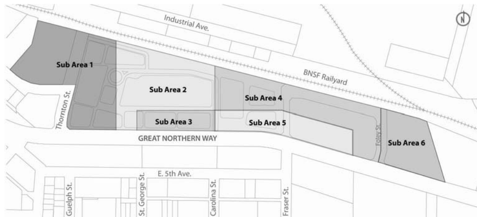
Diagram 2 - Sub-Areas for Maximum Building Heights

3. In section 5.7, Council strikes out the words “set out in Table 3 below.” and substitutes “as set out in Table 3 below.”.