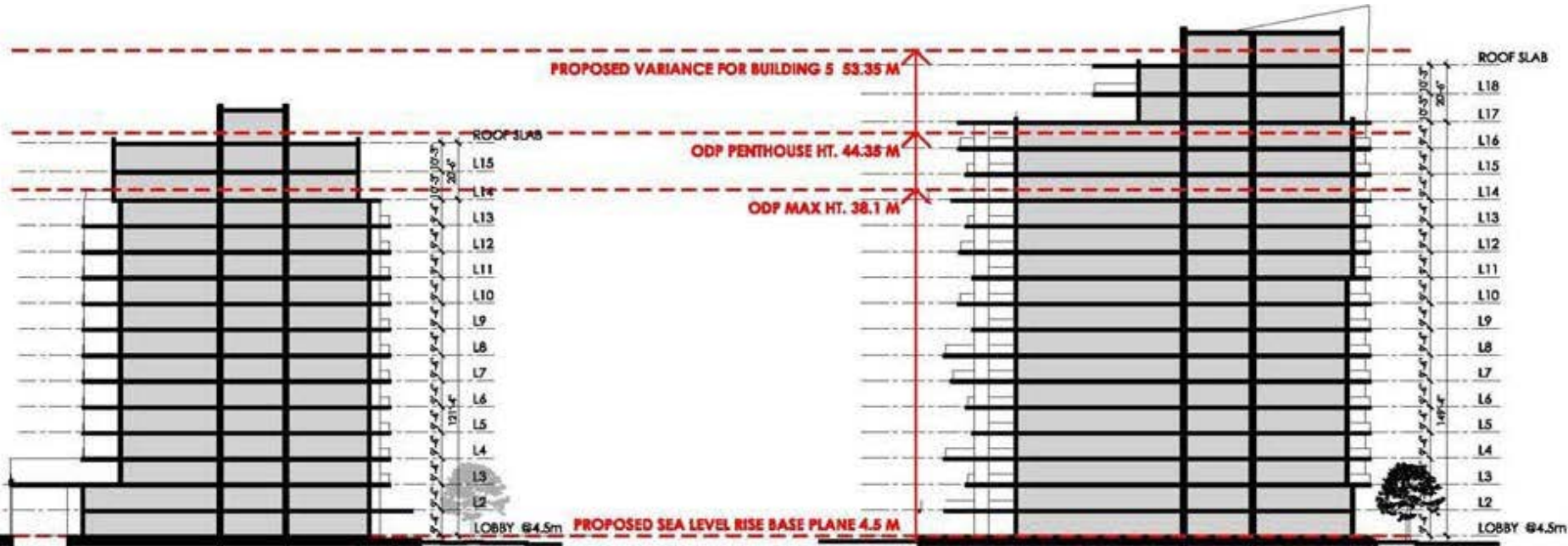
HEIGHT GUIDELINES - TYPICAL (BUILDINGS 1, 2, 3 & 4)