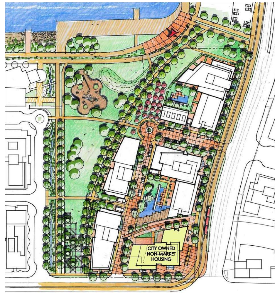
PROPOSED CONCEPTUAL NEIGHBOURHOOD PLAN