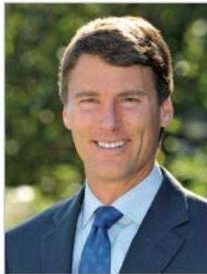
Mayor Gregor Robertson