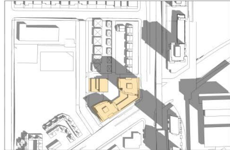
SUMMER SOLSTICE 10:20