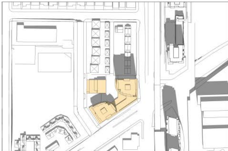
SUMMER SOLSTICE 12:00