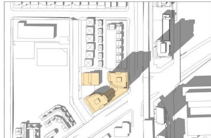
SUMMER SOLSTICE 14:00