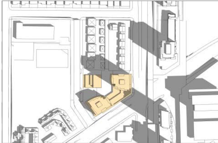
SUMMER SOLSTICE 10:00