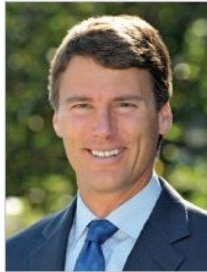
Mayor Gregor Robertson