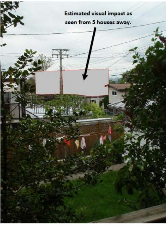
Feb 21 2013 Public Comments from Pascal Poudenx for 4320 Slocan