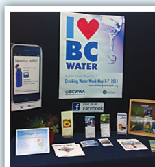
Burnaby Drinking Water Week display at City Hall.