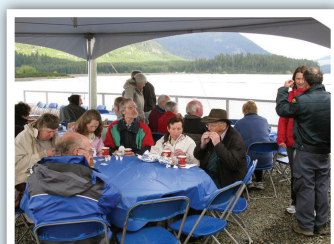
Taking a break at the pristine Sooke reservoir during the Capital Regional District's free public tour of its watershed.