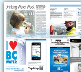
Two page spread in Vancouver Sun.