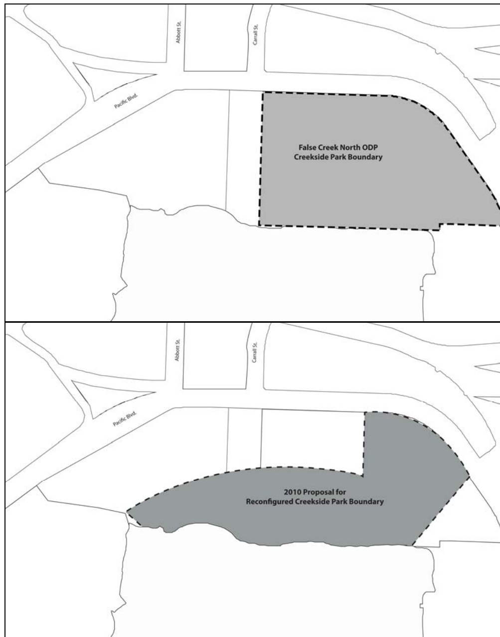
Map 2: A comparison of the Creekside Park extension as anticipated in the False Creek North ODP, and the reconfiguration determined through the facilitated public process.

In recent months, senior city officials have confirmed through technical meetings with Concord and the Province that the park reconfiguration option provides the greatest opportunity to expedite at least parts of the Creekside Park extension.