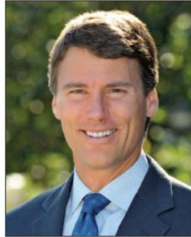
Mayor Gregor Robertson