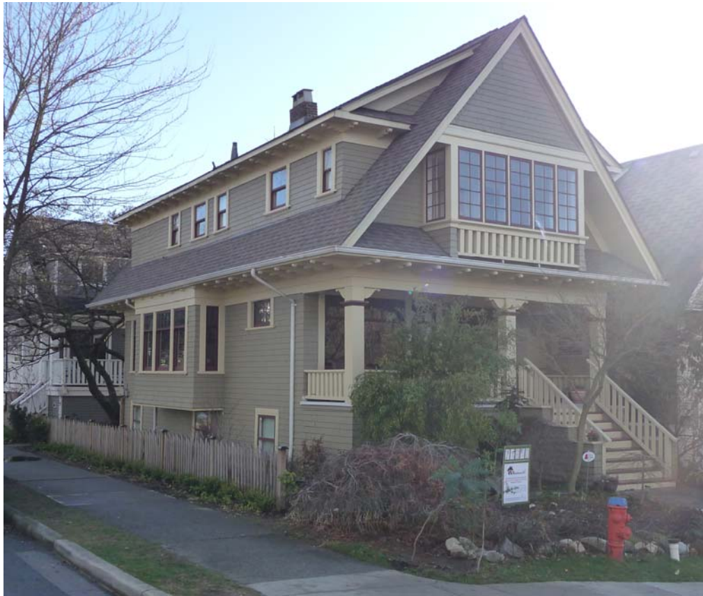
1476 Graveley Street as seen from the corner of Woodland Drive