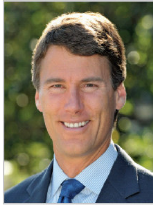
Mayor Gregor Robertson