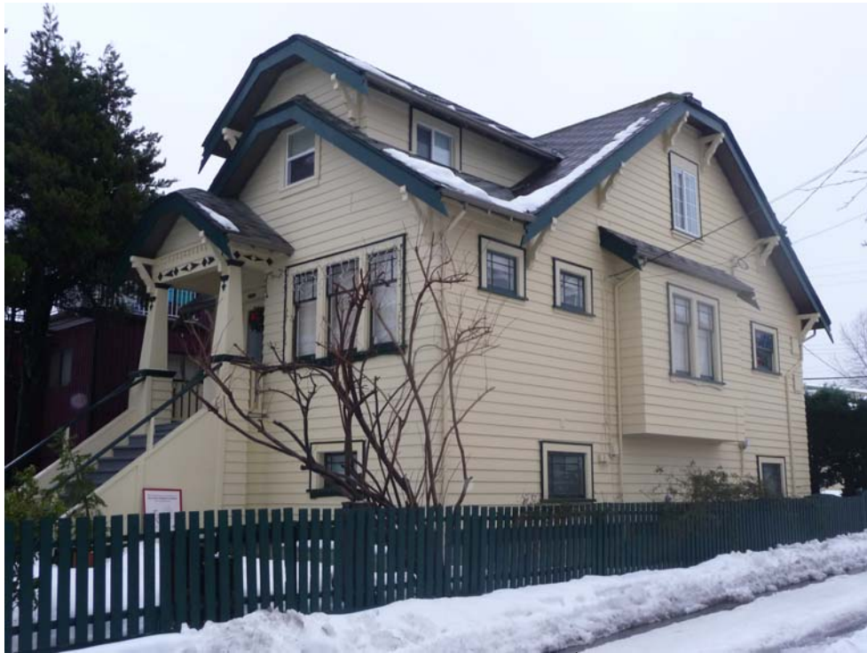
Pidruchny House, 2426 East 23 rd Avenue