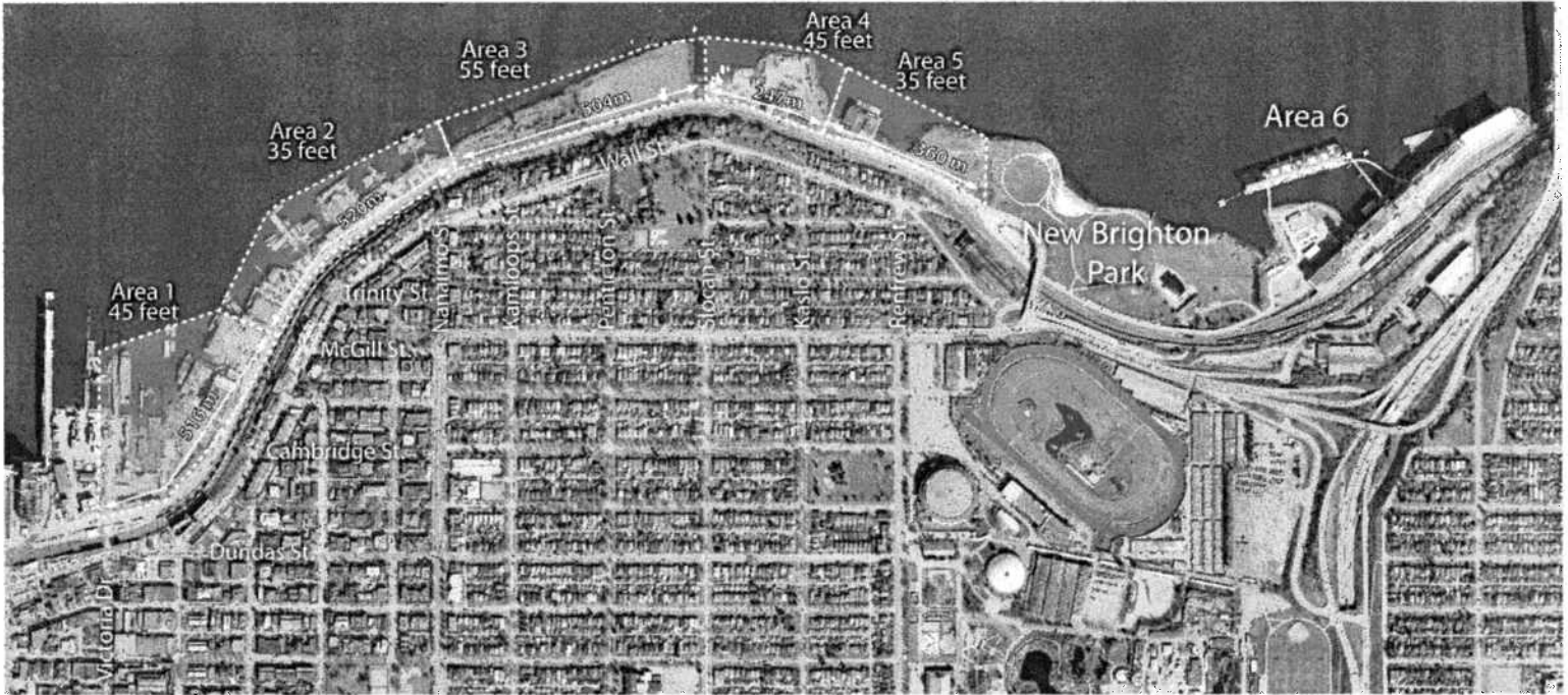
Figure 2: EVPL Area-by-Area Height Guideline Limits

As shown in Figure 3, elevation differences between the escarpment and Port lands vary significantly, impacting opportunities for view preservation. As a result, some loss of water views is possible, with precise impacts depending on both elevation and on-site building location.