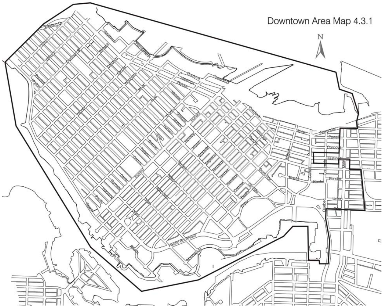
Downtown Area Map 4.3.1