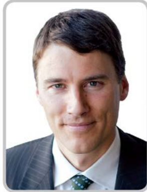
Mayor Gregor Robertson