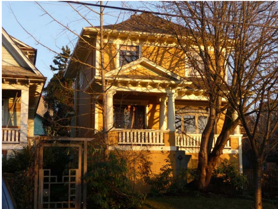
Viani House, 1050 Odium Drive