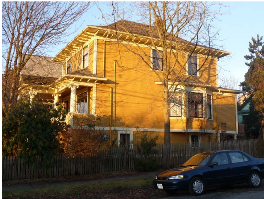
Viani House, 1050 Odium Drive - seen from Napier Street