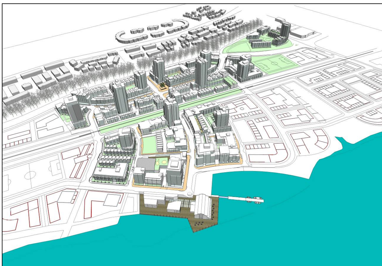
Figure 1: Overall 3D Rendering - Area 1

Drawings prepared by James Cheng Architects on behalf of Parklane Homes.