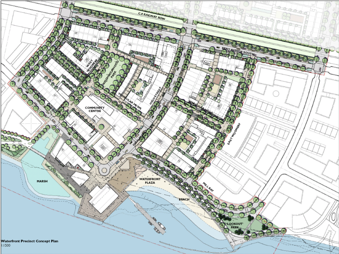
Figure 7: Waterfront Precinct Ground floor Plan