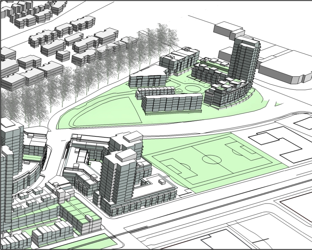
Figure 8: Park Precinct Rendering