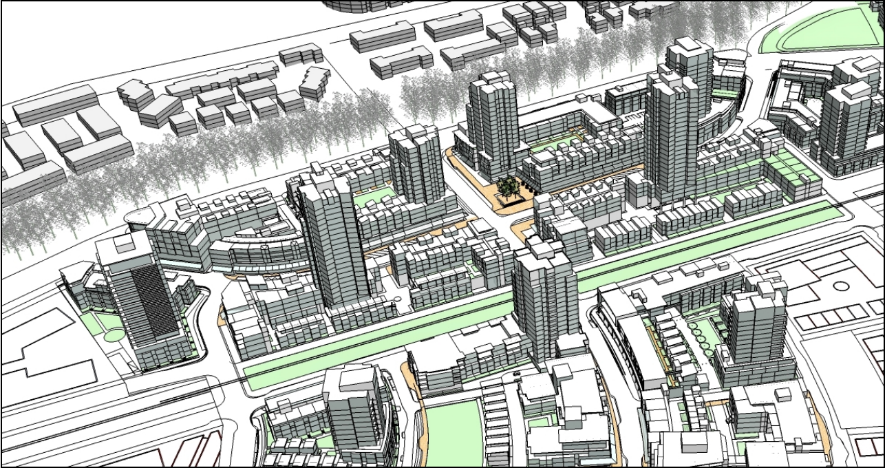
Figure 4: Townsquare Precinct Rendering