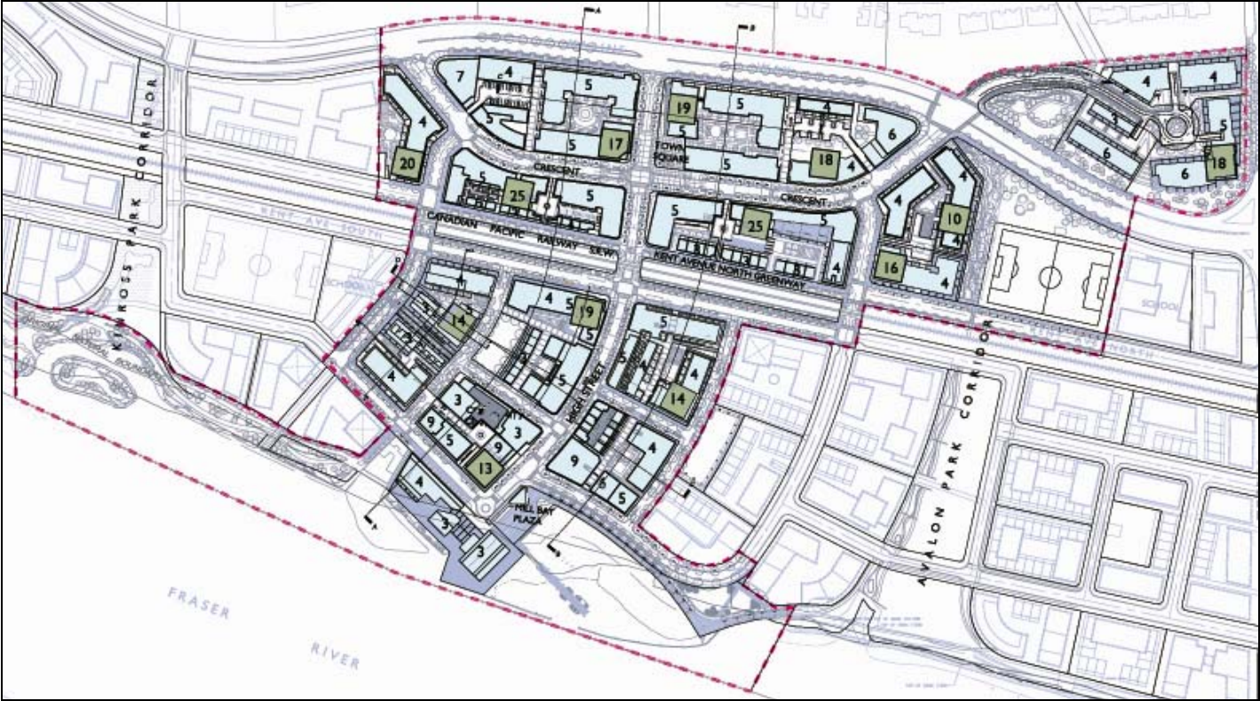
Figure 3: Building Heights Plan