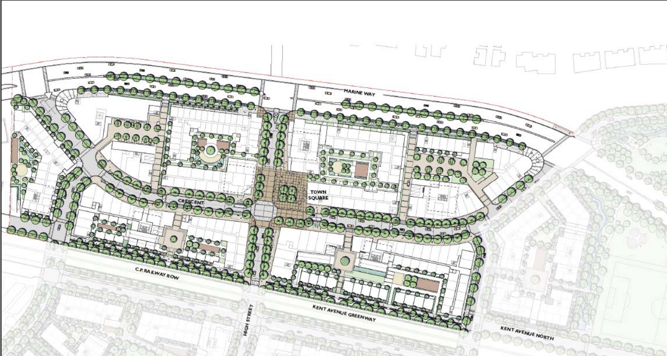
Figure 5: Townsquare Precinct Ground floor Plan