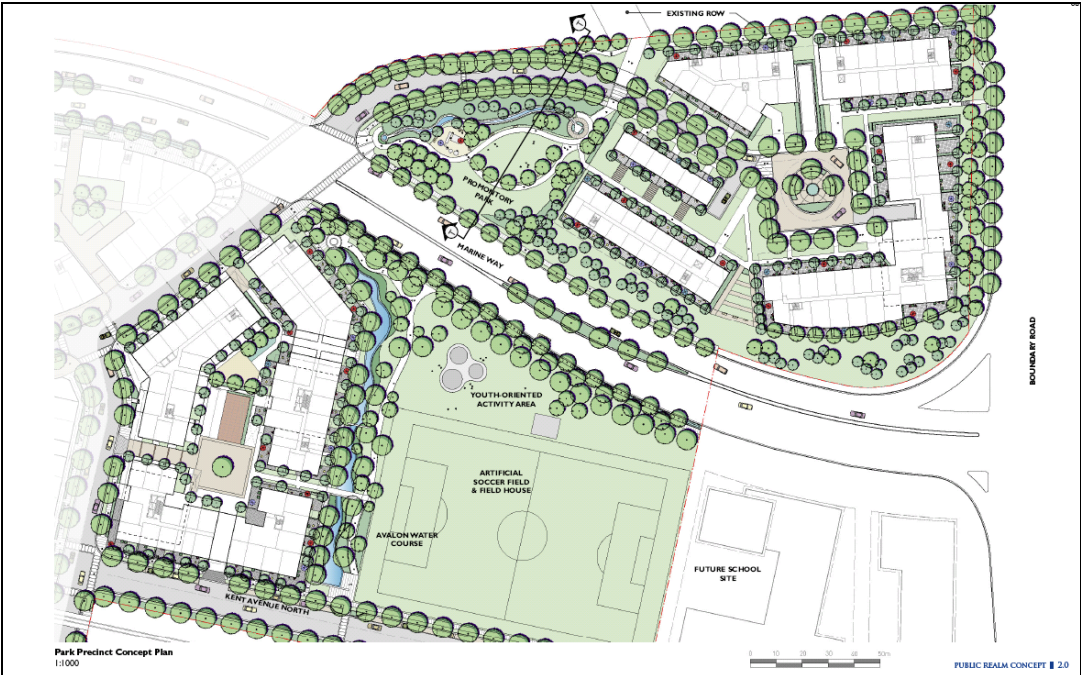
Figure 9: Park Precinct Ground floor Plan