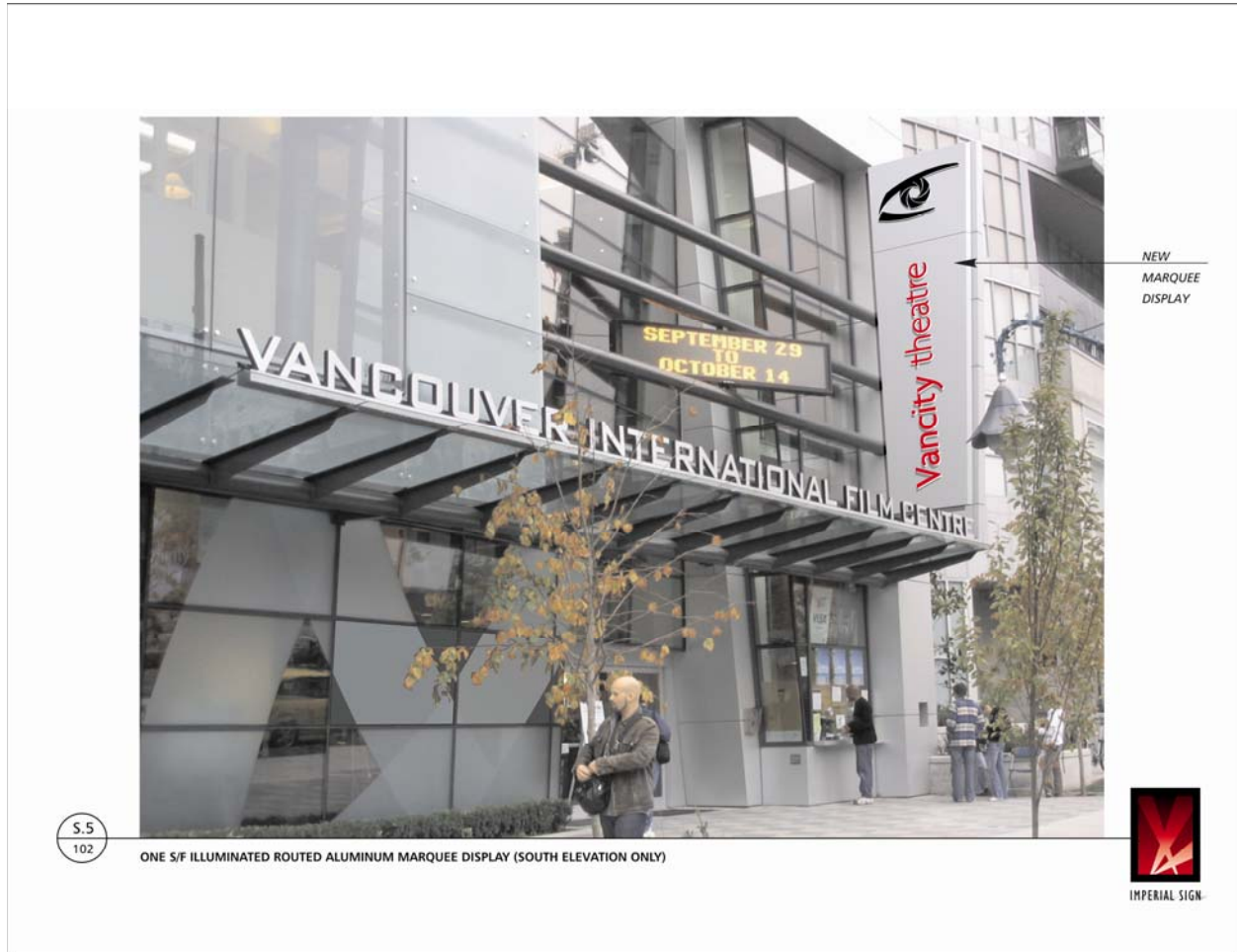
Illustration of Proposed Sign