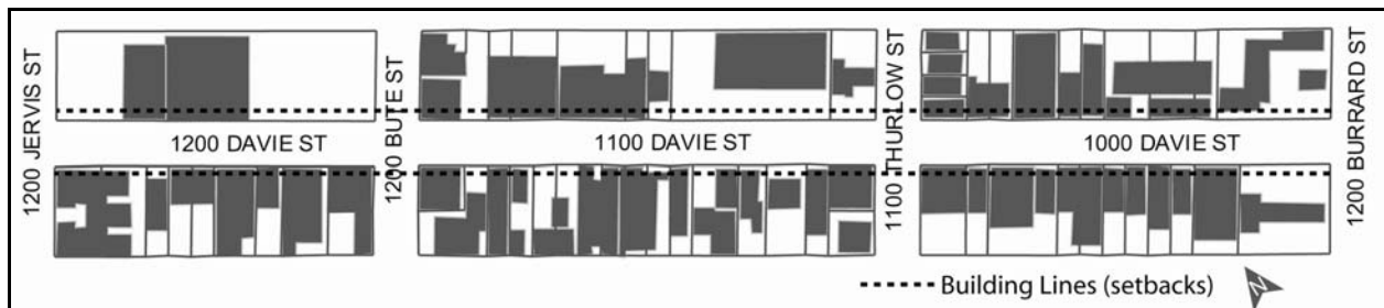
FIGURE TWO. Map of Proposed Building Lines

The use of building lines on Davie Street for sidewalk widening received wide spread public support when it was packaged with other recommendations as part of the Downtown Transportation Plan. Since that time a series of meetings have also been held with local stakeholder groups, the Davie Village BIA has expressed support for the establishment of the building line while the West End Residents Association is in favour of the creation of wider sidewalks, but by narrowing the street and eliminating parking. Nonetheless, there is widespread support for widening the sidewalks in Davie Village.