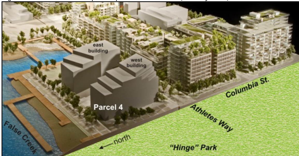
Figure 3 – Parcel 4 development permit submission (January 2007)

In conjunction with their development permit application, the architects submitted a rezoning application to amend the CD-1 By-law to permit the higher building height. That application is the subject of this report.