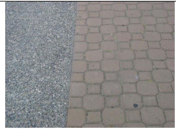
Figure 2a - Detail of Concrete unit pavers with exposed aggregate concrete