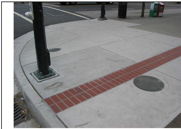
Figure 3 - Decorative Highlight Pavers