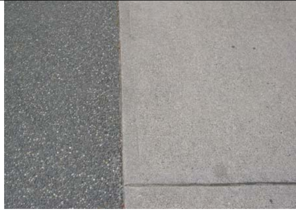
Figure 1a - Detail of Broom Finish Concrete with exposed aggregate concrete