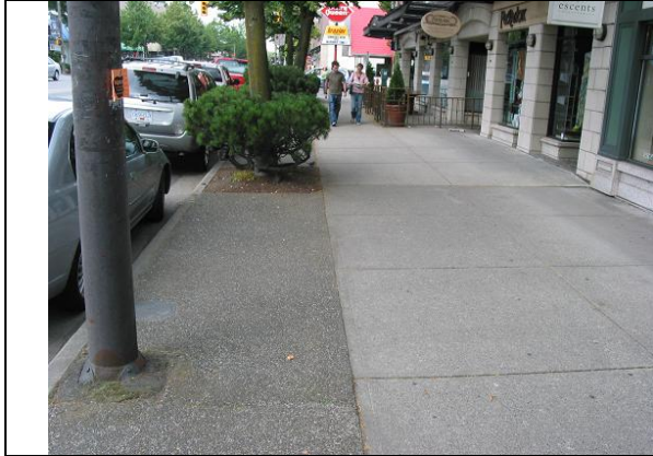
Figure 1- City Standard Broom Finish Concrete

appropriate the City also intends to install some decorative highlight pavers and leave space for concrete stamps and community public art (see figures 3 & 4).