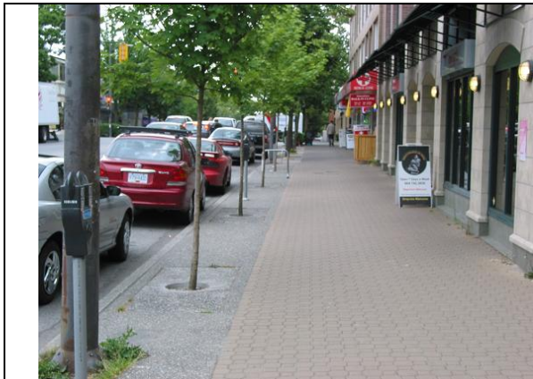
Figure 2- Concrete Unit Pavers