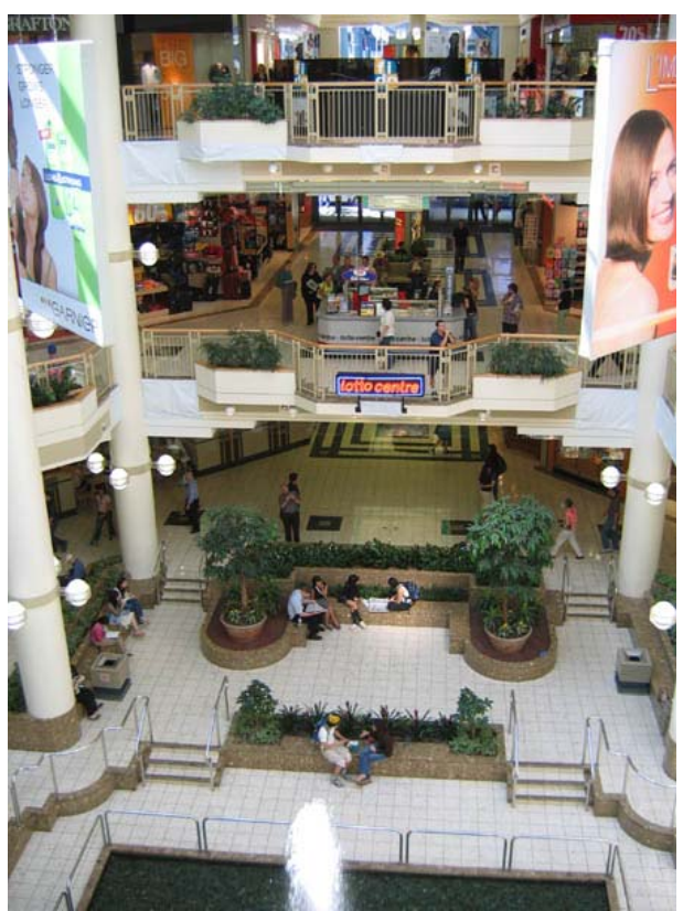
Figure 2: Elevated perspective of Pacific Centre atrium adjacent to basement-level food court, which is proposed for enclosure, corner of Granville Street and Dunsmuir Street.