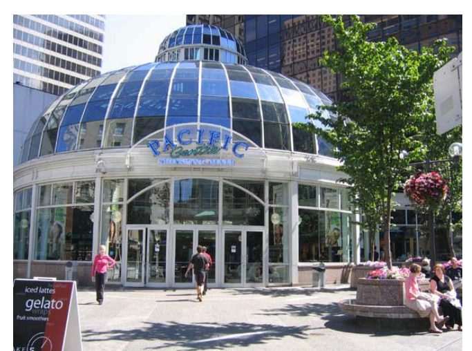
Figure 4: Pacific Centre atrium and plaza, corner of West Georgia Street and Howe Street. There may be the opportunity to expand this existing atrium and provide a publicly accessible atrium and space for cultural programming.