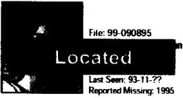
File: 99-090895 Located Last Seen: 93-11-?? Reported Missing: 1995