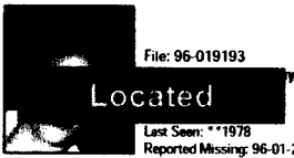
File: 96-019193 Located Last Seen: **1978 Reported Missing: 96-01-22