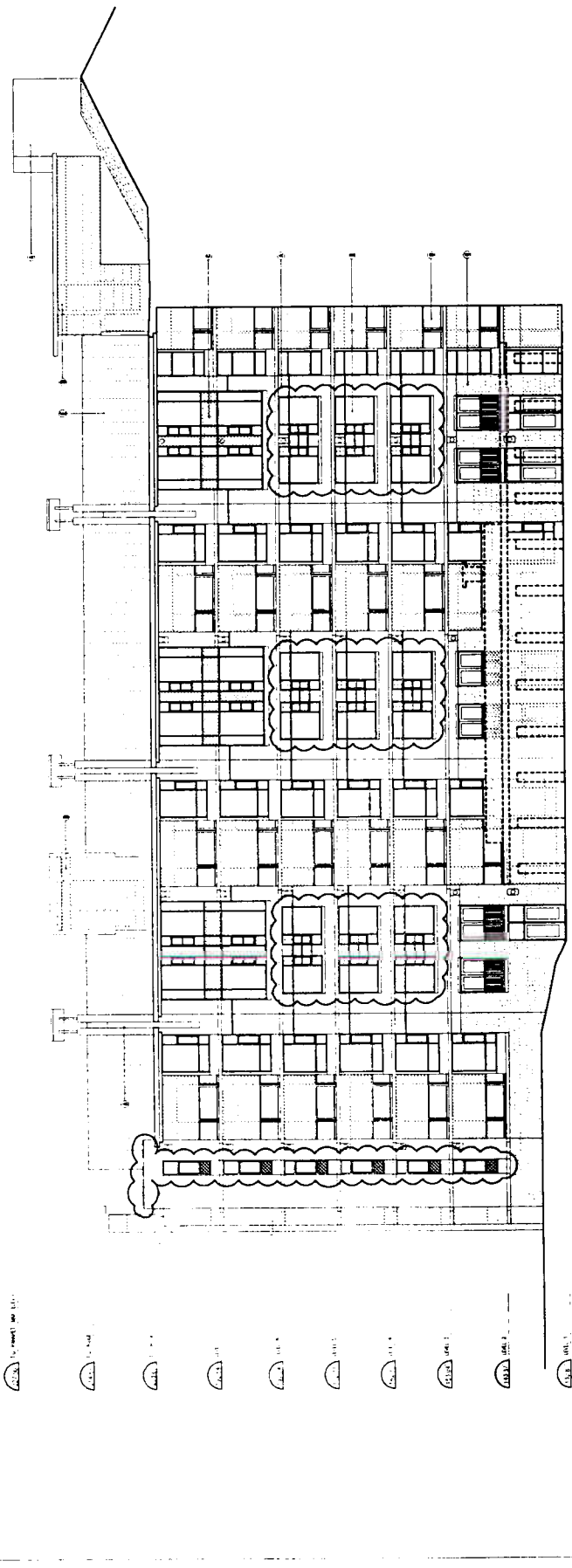
EAST ELEVATION - COURTYARD