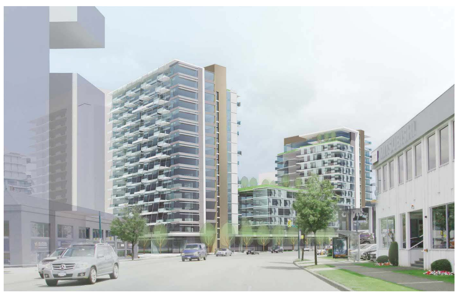
Original CD-1 Rezoning Rendering

Add 'Fitness Centre' and 'Animal Clinic' as allowable uses