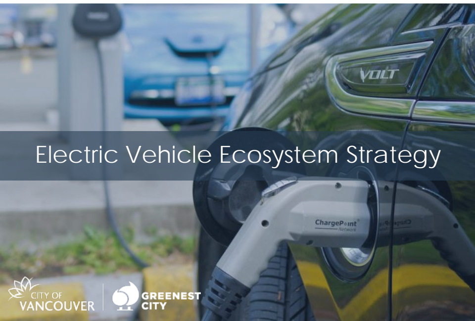
Electric Vehicle Ecosystem Strategy