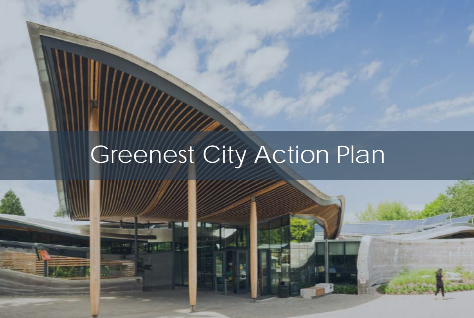
Greenest City Action Plan