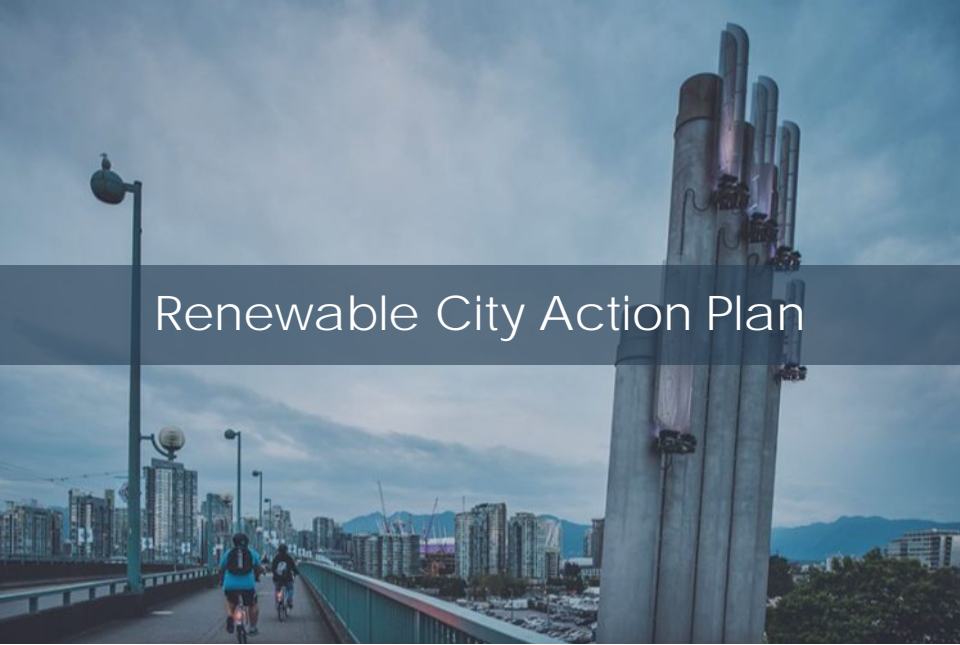
Renewable City Action Plan