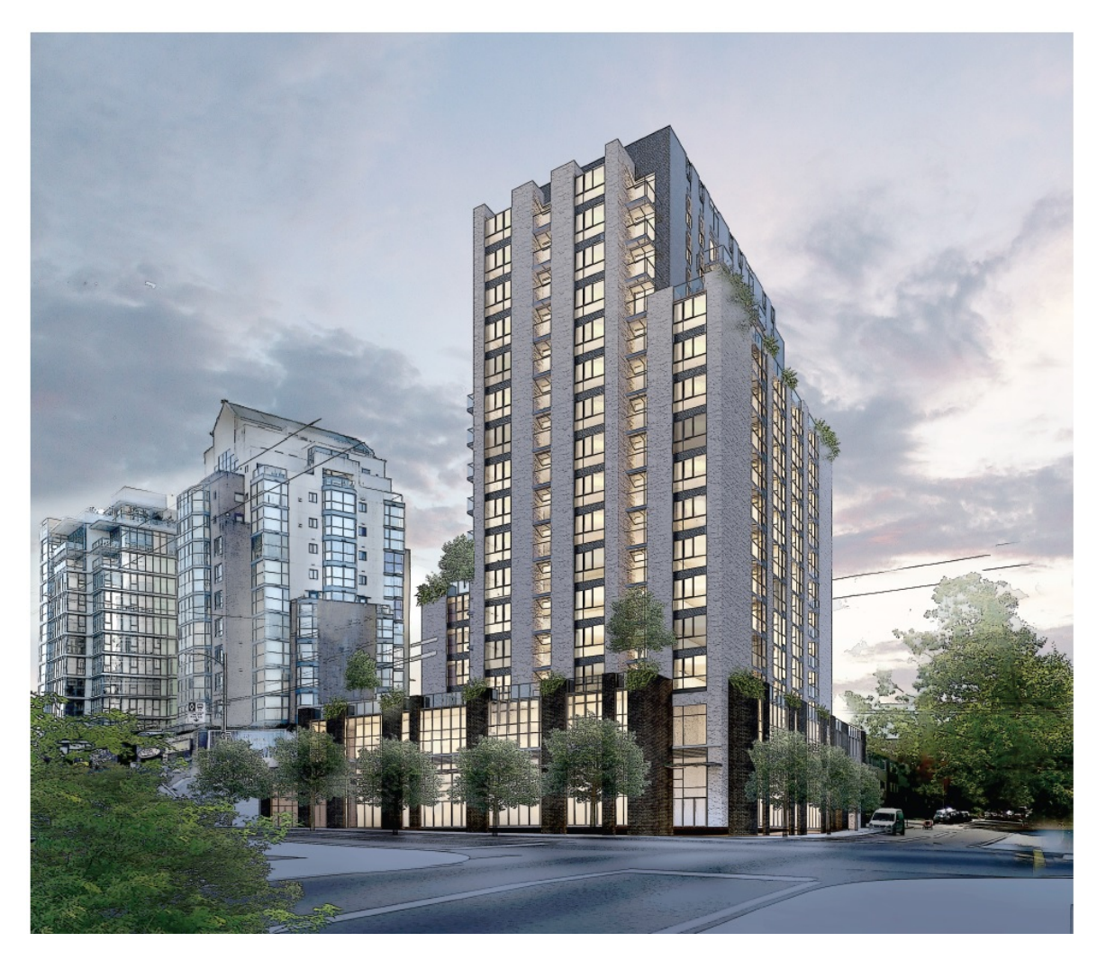
CD-1 Rezoning: 1296 West Broadway