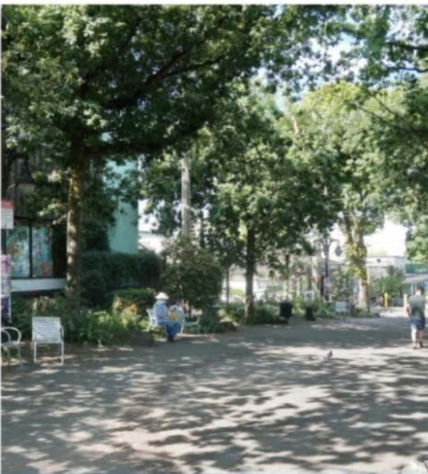
Napier Square Greenway Locally-Serving