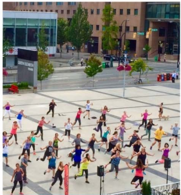
Queen Elizabeth Theatre Plaza City-Serving