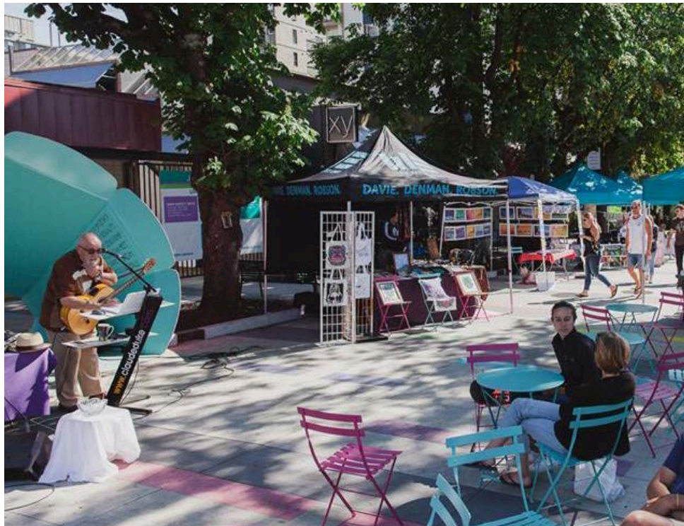
Diagram 3 – Jim Deva Plaza

The Jim Deva Plaza stewardship pilot is also informing the preparation of the Plaza Stewardship Strategy , particularly how it can be applied to other future street-to-plaza projects. Since the summer of 2016, this plaza has been a key pilot in testing the community partnership approach. Early community consultation for Jim Deva Plaza indicated that stewardship was required to better resolve issues related to management, cleanliness and programming of the plaza. To realize the full potential of the space, staff proposed a two-year pilot stewardship framework.