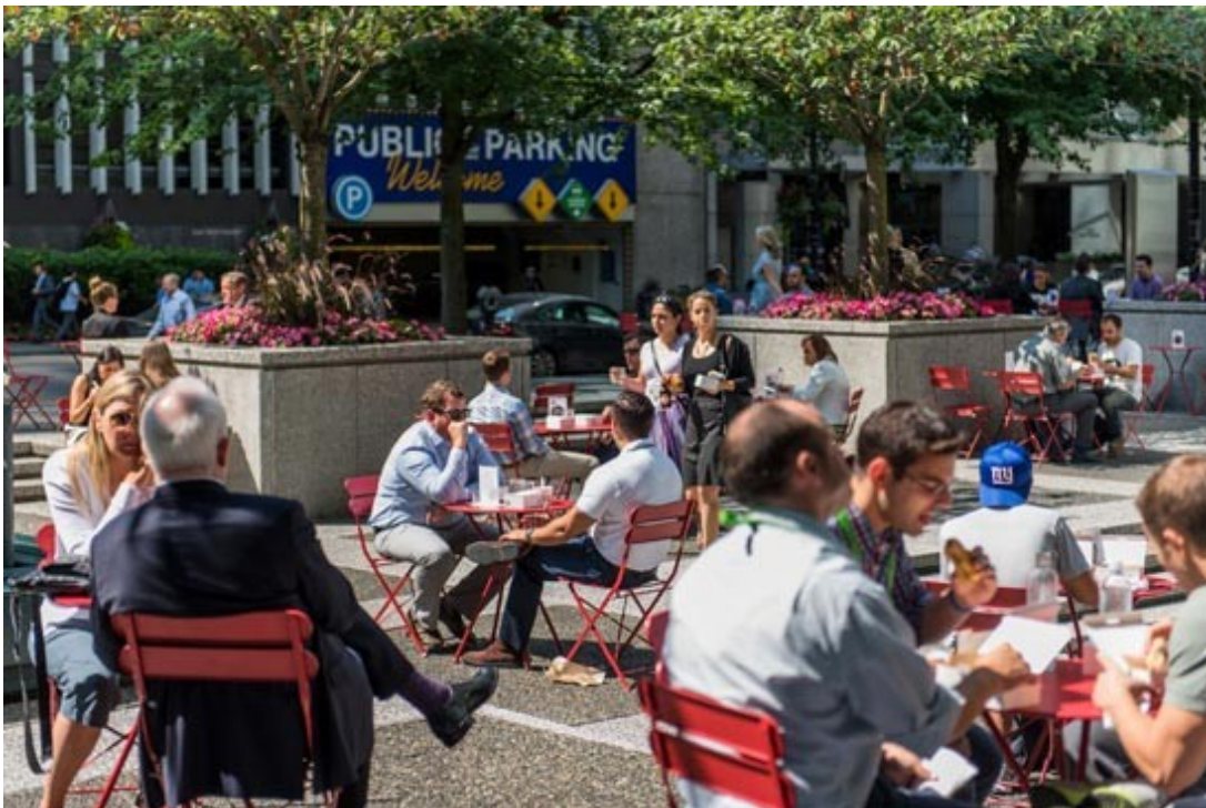
Diagram 4 -Oceanic Plaza, Perch Program

As part of the Laneways Program the DVBIA have been involved in reshaping city laneways into engaging, accessible public spaces that contribute to the vibrancy of the city. The program includes Alley Oop, located off Pender Street, between Granville and Seymour streets (stewarded by a partnership between the DVBIA and VIVA). It has also included Ackery's Alley, located off Smithe Street, between Granville and Seymour streets. Ackery's Alley will launch in 2018 and will be jointly stewarded by Vancouver Civic Theatres, DVBIA and VIVA. The City have cost shared with the DVBIA on the Laneway Program and recognise the value in sustaining this program from a stewardship perspective in 2018.