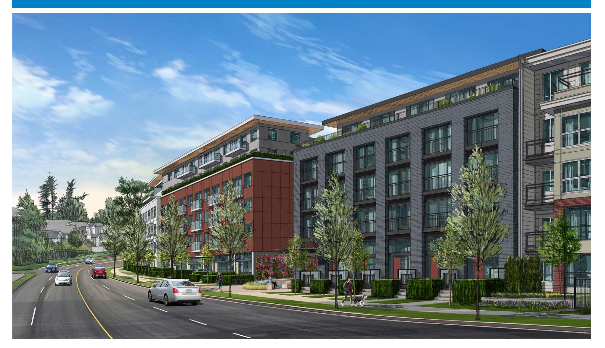
CD-1 Rezoning: 3681 Victoria Dr & 1915 Stainsbury Ave Public Hearing | November 14, 2017