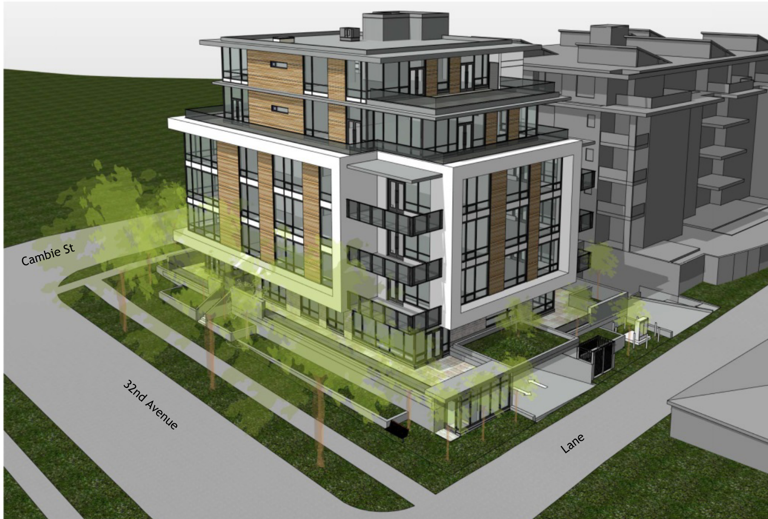
Aerial view from 32 nd Avenue looking southeast