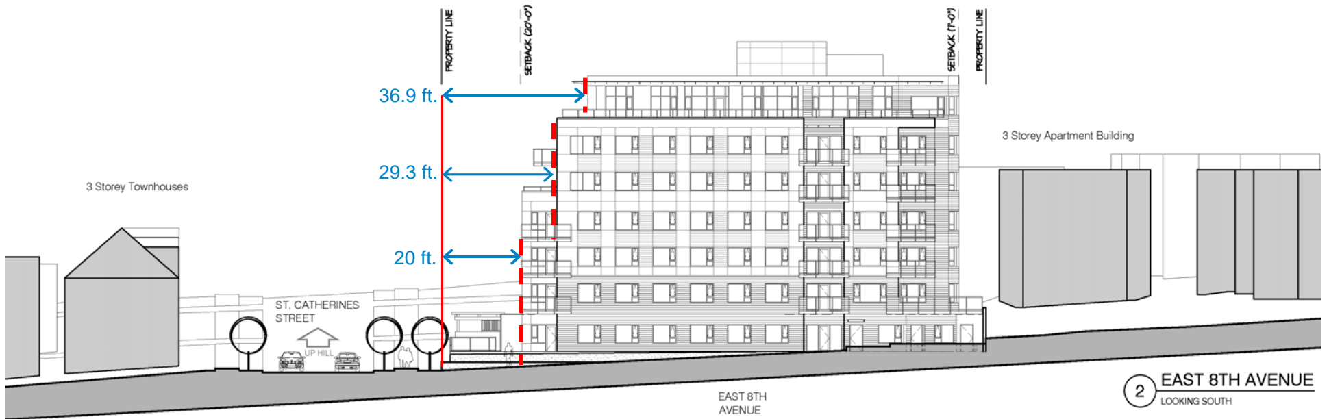
2 EAST 8TH AVENUE LOOKING SOUTH