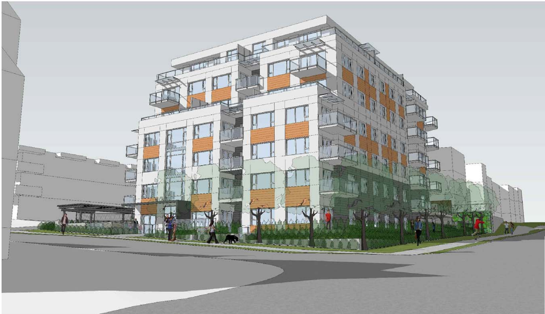
CD-1 Rezoning: 870 E 8th Avenue (Red Door Housing Society) Public Hearing | July 11, 2017