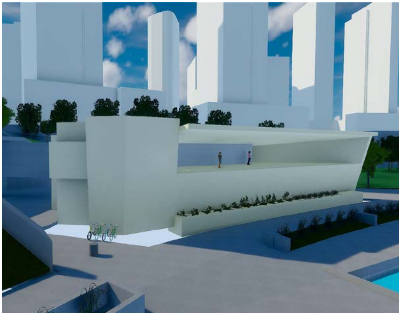
View from Harbour Green Park looking east

Increase the permitted floor area from 600 sq. m to 975 sq. m to allow: