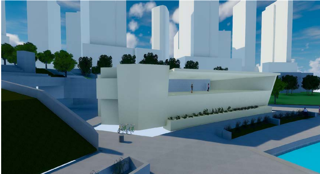
View from Convention Centre looking south