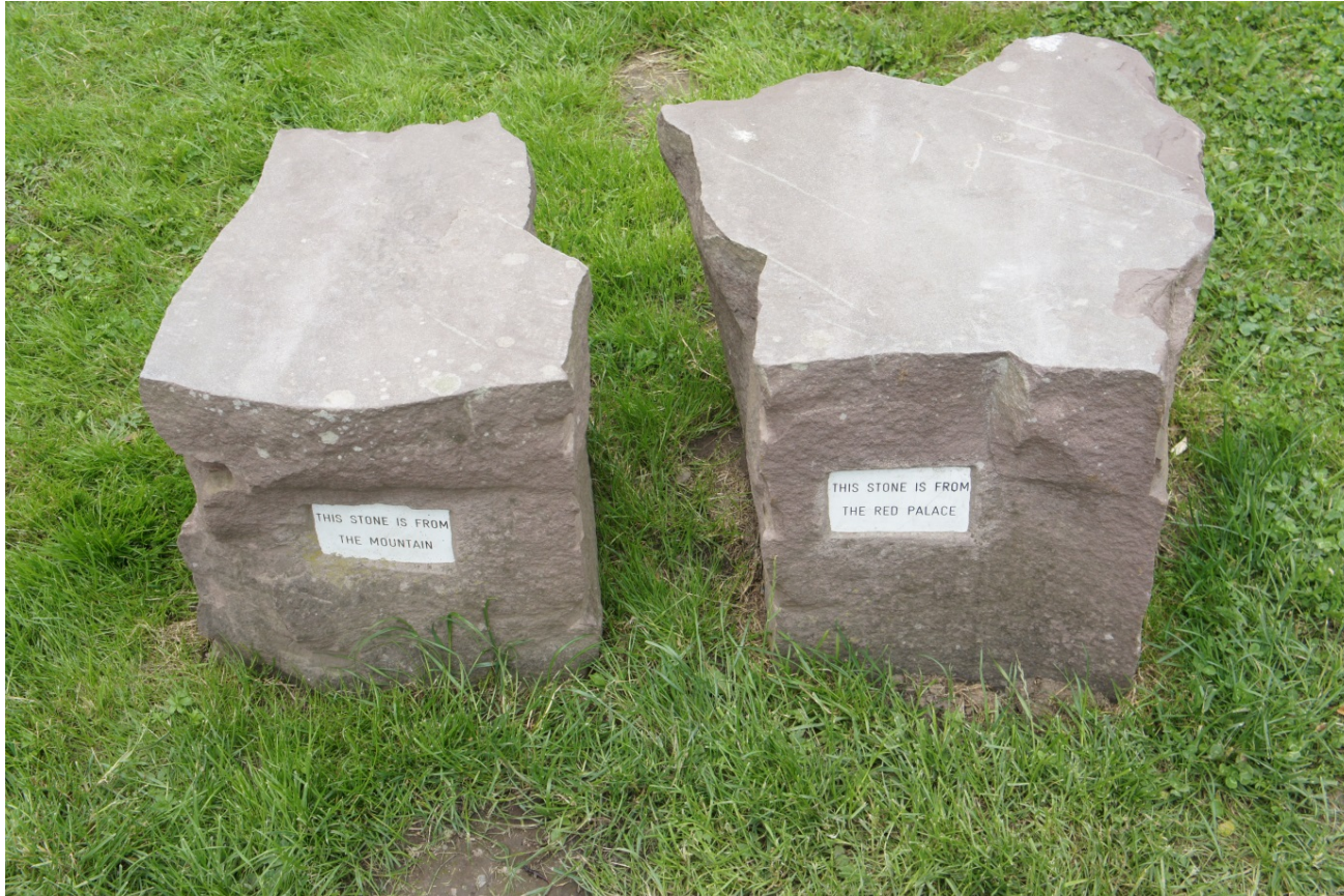
Jimmie Durham This Stone Is from the Mountain/This Stone Is from the Red Palace, 1992 Documenta 13, Kassel, Germany