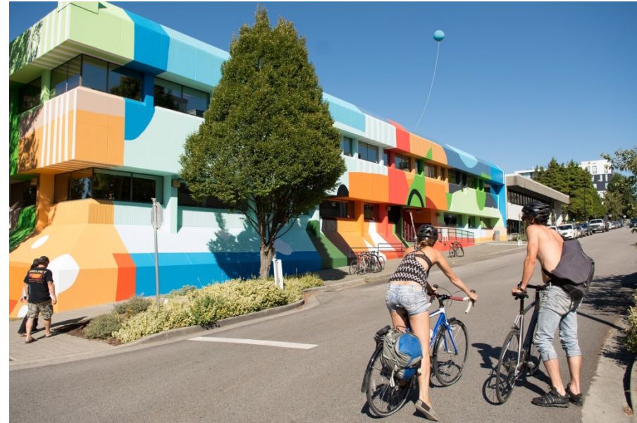
Scott Sueme Box of Crayons , 2016 Hootsuite, 5 East 8th Ave