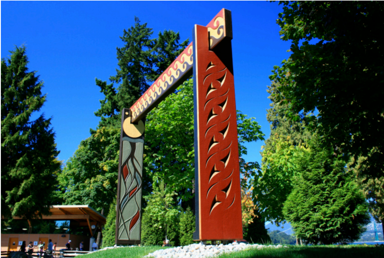
Susan Point, People Among the People , 2008 Brockton Point Visitor Centre