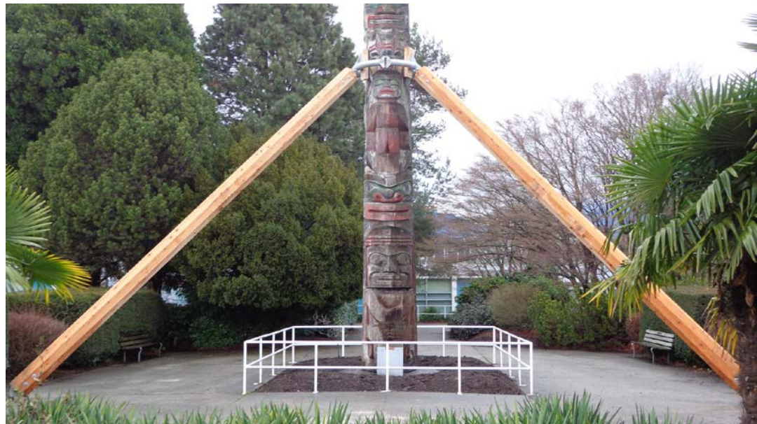
Centennial Pole Stabilization