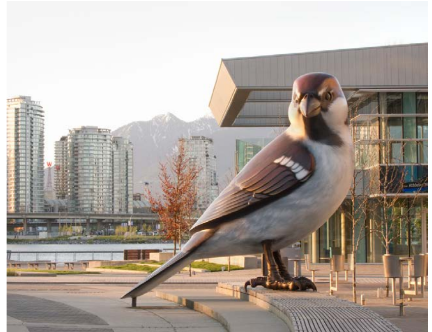
Myfanwy MacLeod The Birds , 2010 Southeast False Creek Plaza (Olympic Village)