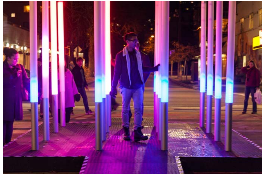
Tangible Interaction Shine with Pride, 2016 Lumière Festival