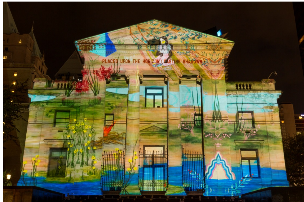
Burrard Arts Foundation Façade Festival, 2016 Vancouver Art Gallery