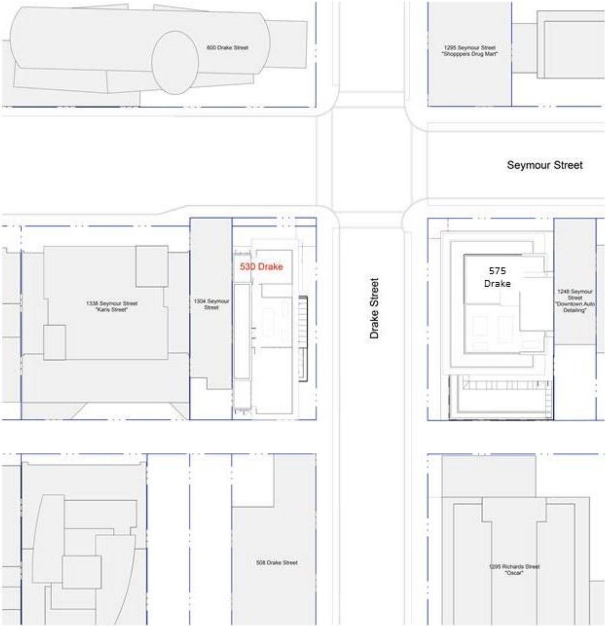
Figure 5: Site Plan