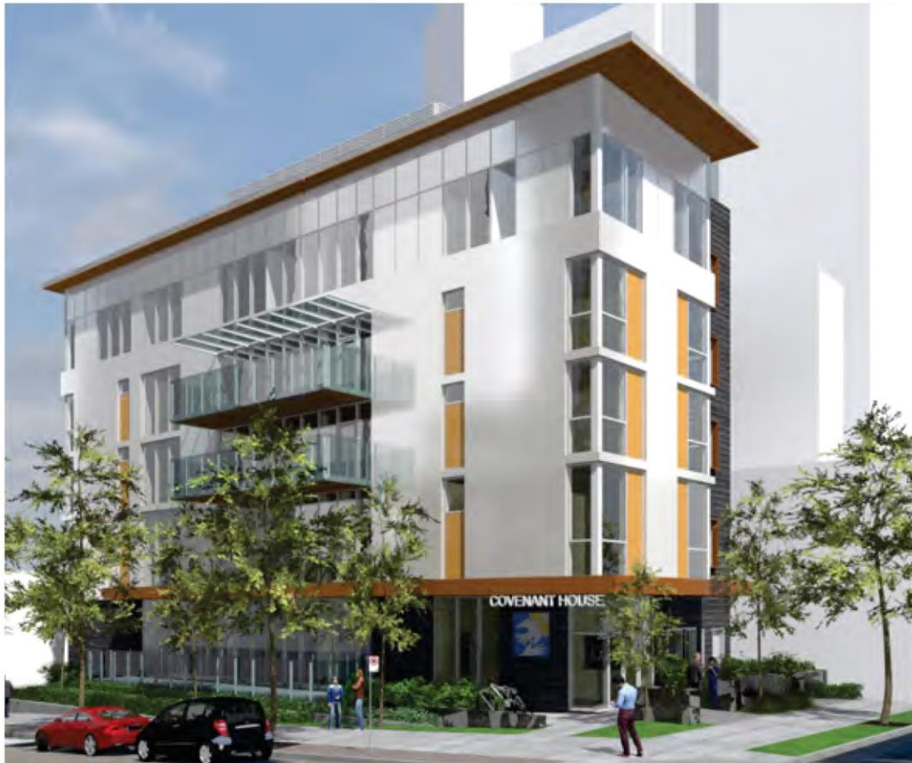
Figure 2: Proposed development at 530 Drake Street, looking southeast from Drake and Seymour streets