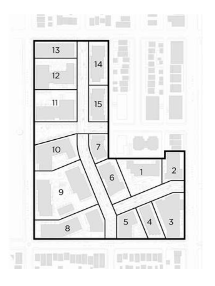
Figure 2: Sub-areas for Maximum Permitted Building Storeys and Building Height

2.2 The site is to consist of fifteen sub-areas generally as illustrated in Figure 2, solely for the purpose of allocating and calculating maximum permitted building storeys and building height.