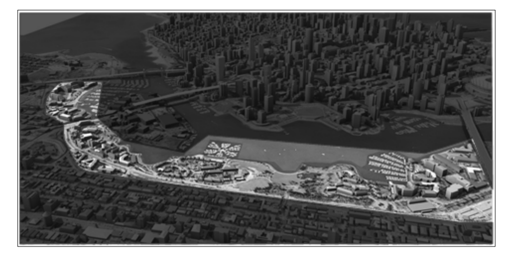
FIGURE 1. FALSE CREEK SOUTH NEIGHBOURHOOD

This neighbourhood has a rich history and is an important park, recreational and housing asset in Vancouver. The City, through its Property Endowment Fund, owns approximately 80% of the False Creek South land area, including approximately 23 acres of park land (see Figures 1 and 2).