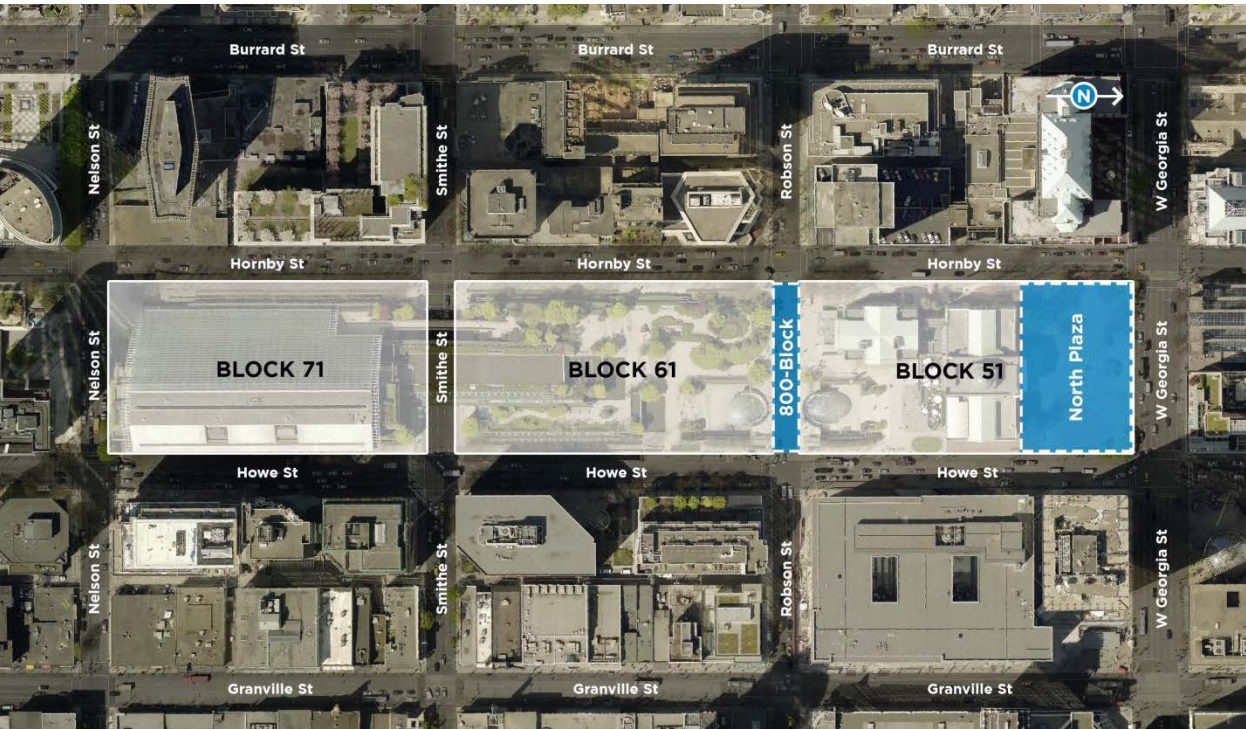
Figure 1: Block 51, 61, and 71 Context Map

centre, bringing much needed open space to the downtown core. The site's official completion in 1983, with the renovation of the old courthouse into the Vancouver Art Gallery, transformed civic blocks numbered 51, 61 and 71 into Vancouver's largest urban public space.