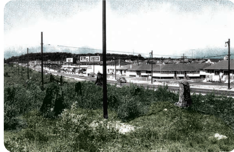
Early 1900's Rail Lands/Housing