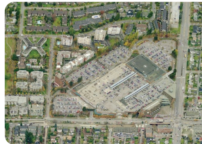
Current Oakridge Centre