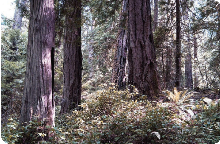
1st Growth Forest